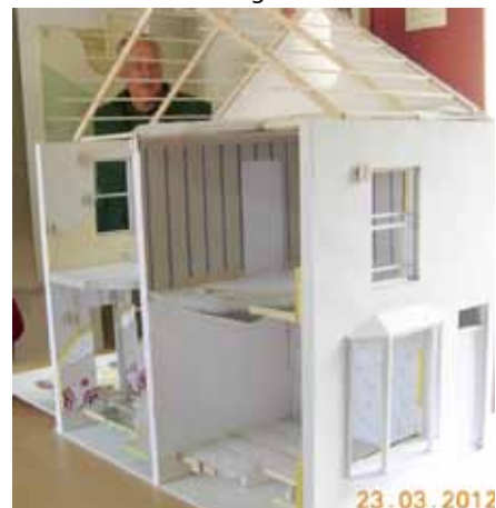
Model illustrating types of insulation

There were also models showing their methods of insulating the walls of houses.